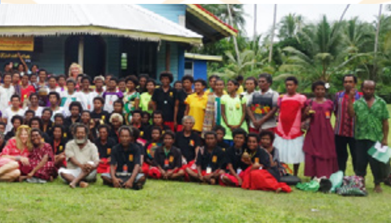
Caring for Kiriwina Village Birth Attendants.

Our vision is to care for the people living in the Trobriand Islands, in particular to focus on the health and education of pregnant women, women in childbirth, newborn infants and children.